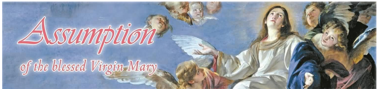
A HOLY DAY OF OBLIGATION