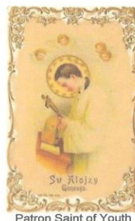
Patron Saint of Youth

All proceeds will go toward the ongoing restoration work of St. Thomas the Apostle Church